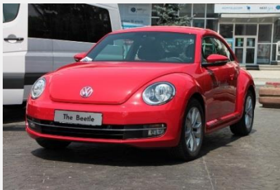
Consumption = 150km, Demand = 50km/h