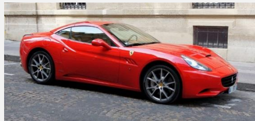
Consumption =150km, Demand =150km/h